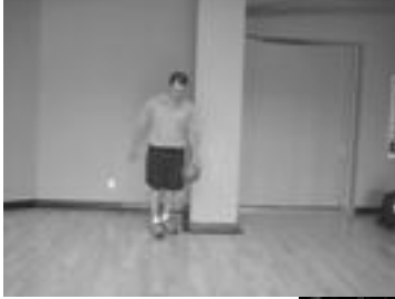
Exercises For Injuries