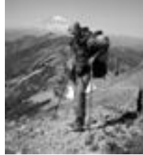
Rick Hiking 4300 km/ 5 months from Mexico to Canada