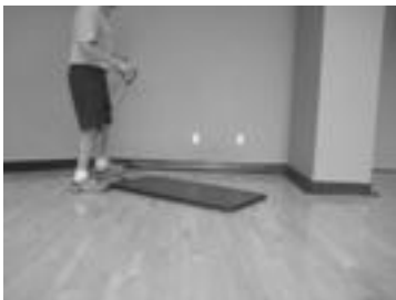
Exercises For Injuries