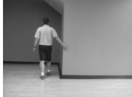
Exercises For Injuries