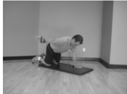
Exercises For Injuries